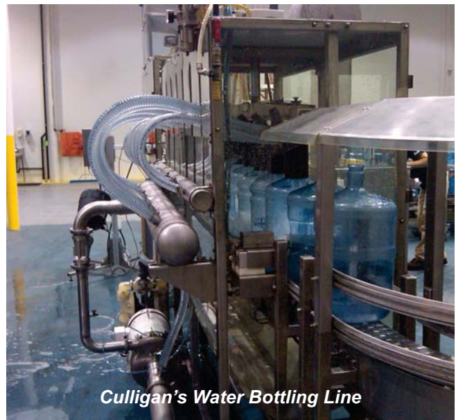
Culligan's Water Bottling Line

Non-contacting ultrasonic sensors were installed at the top of the tanks. Two joined 10,000 gallon tanks contain Spring Water. Another two joined 10,000 tanks hold reverse osmosis water and one 7,500 gallon tank contains distilled water.